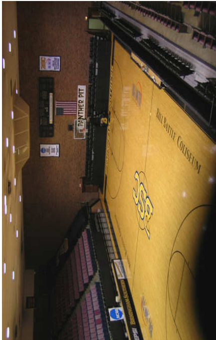
Bill Battle Coliseum