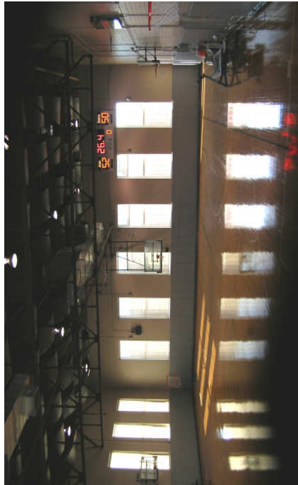
Sport Center Gymnasium